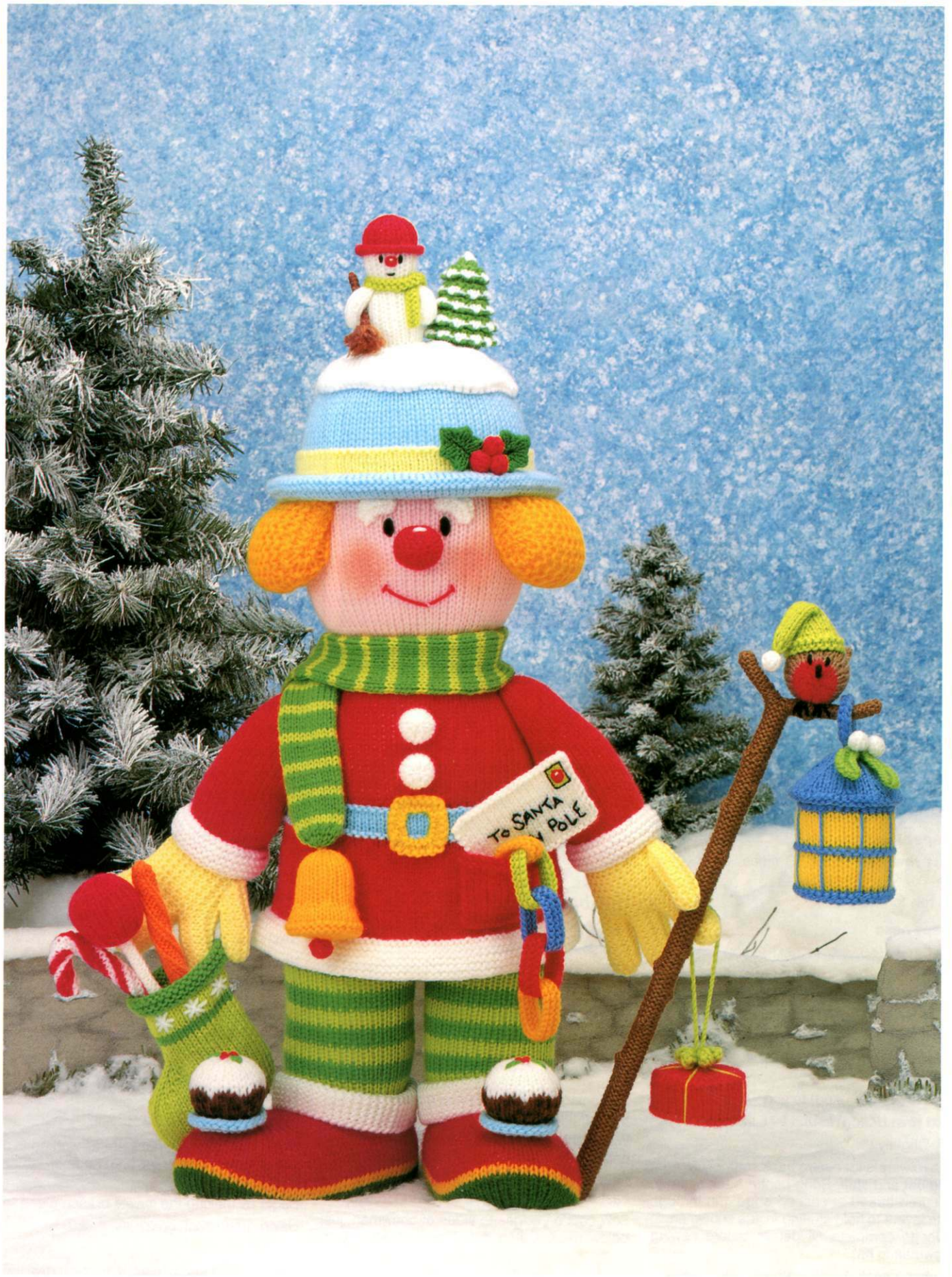
Jolly Mr Jingle